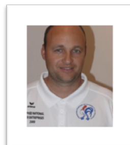
Europe Champion of clubs 2011 with Monaco

EXPENSES OF REGISTRATION : 120 € / threesome - 40 € / doublette